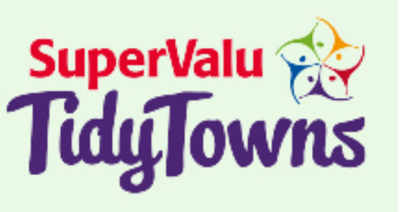
Supporting TidyTowns for over 30 years .

560k primary school children across 3,241 schools learned about the importance of bees and biodiversity through the 'Save the Bees' initiative.